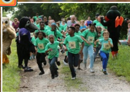
Fifteen families from The Family Tree of Maryland traveled from Baltimore City for a fun-filled day of exploration at Irvine!

The Irvine Community came out to celebrate the opening of Bauer Preserve at our Summer Solstice Sunset 5K and Family Festival. Runners enjoyed the winding 93 new acres of trails generously provided by The Charles T. Bauer Charitable Foundation .